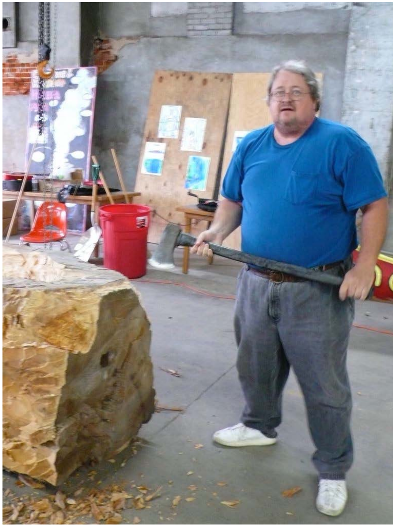
Mad Dog demonstrating carving with an axe, KIPP Dugout Canoe